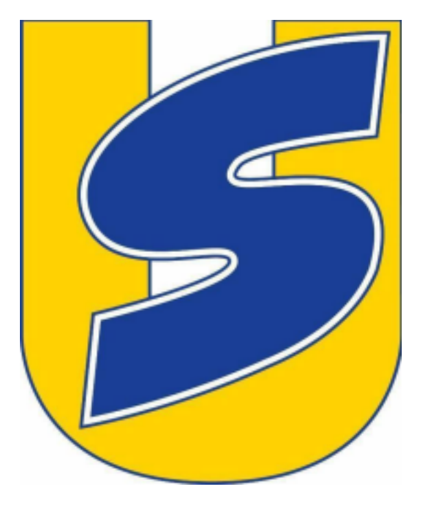
Nursing Program Student Handbook

State Community College Health Sciences Division